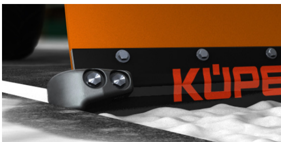
Küper curbstone deflector

A snow clearing blade accessory specifically developed for demanding requirements on the road. Durable, flexible and efficient.